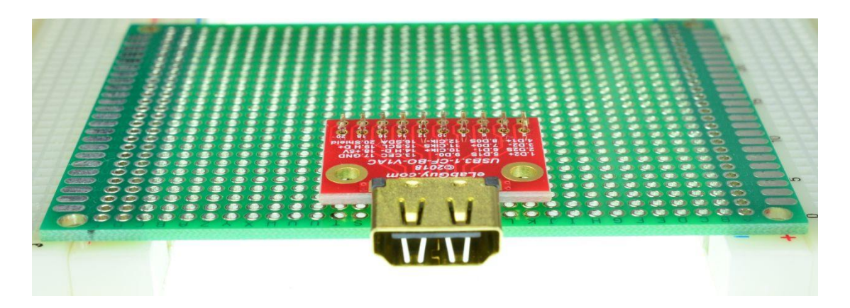
Figure 3: Solid Mounting on prototype PCB