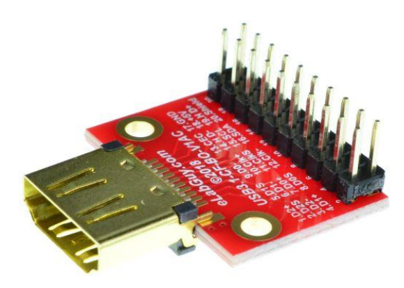
Figure 2: HDMI-AF-BO-V1AC